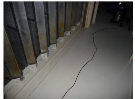
All paint coatings been applied