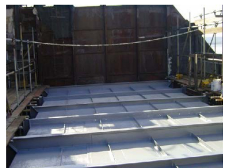
All paint coatings been applied