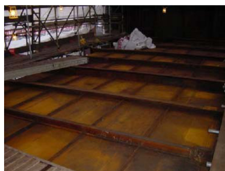
First layer of primer and paint completed