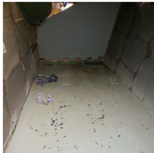
DIB cleaned surface