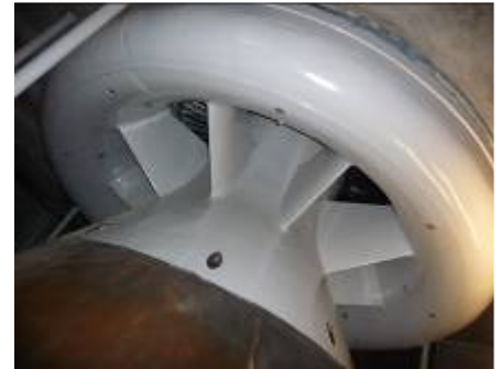
All paint coatings been applied