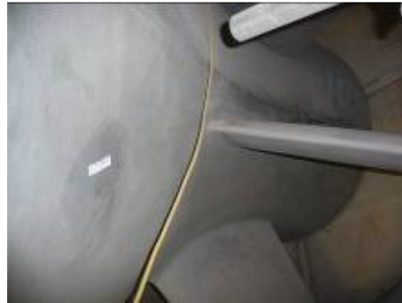
First layer of primer and paint completed