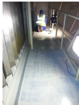
First layer of primer and paint completed